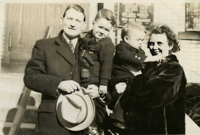
David's one with two Sons