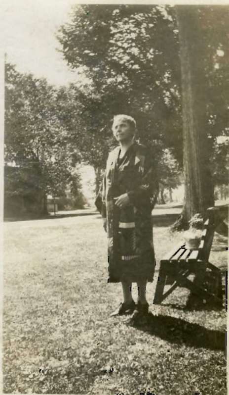
sister, June 1985.